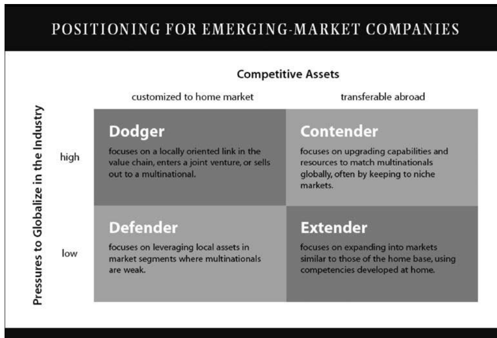
EXHIBIT 18-6 STRATEGIC OPTIONS FOR EMERGING-MARKET COMPANIES