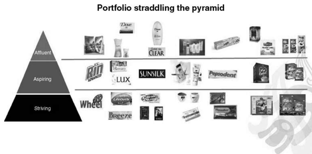
EXHIBIT 18-7 HINDUSTAN UNILEVER'S BRAND PORTFOLIO